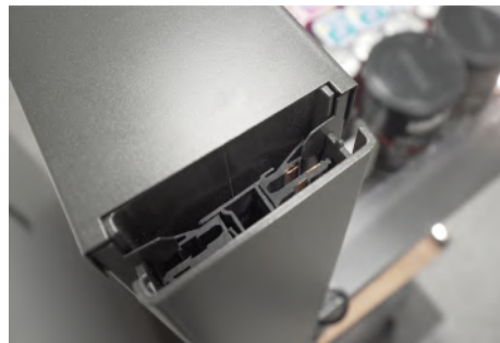
JUNIC current conductor profiles suitable for all standard shelves