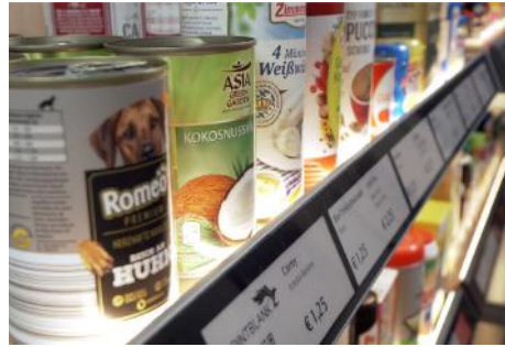
Horizontal and vertical product lighting with adjustable LED technology