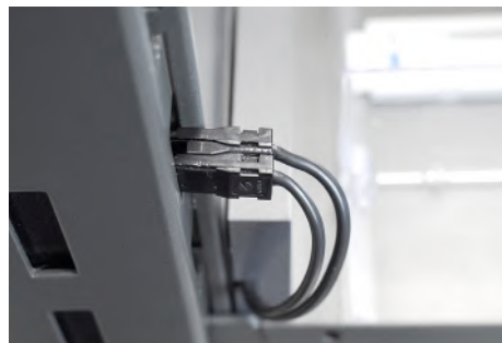
Flexible plug positions for lighting and electrification